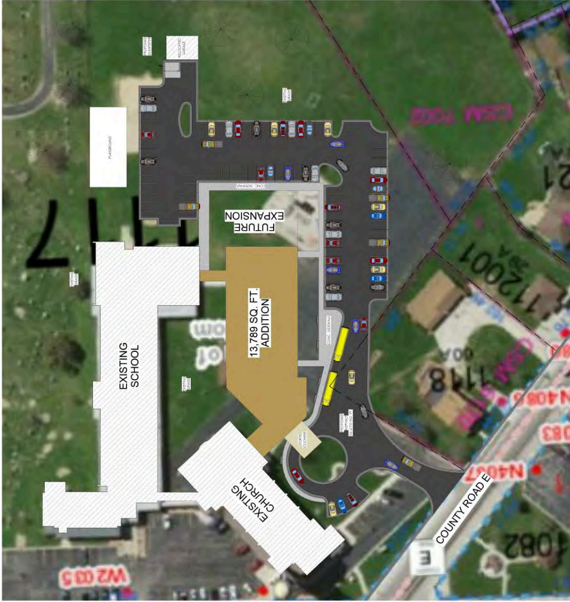
1 Architectural Site Plan 01/17 1" = 30'-0"

St. Nicholas Catholic Church Freedom, WI 004229